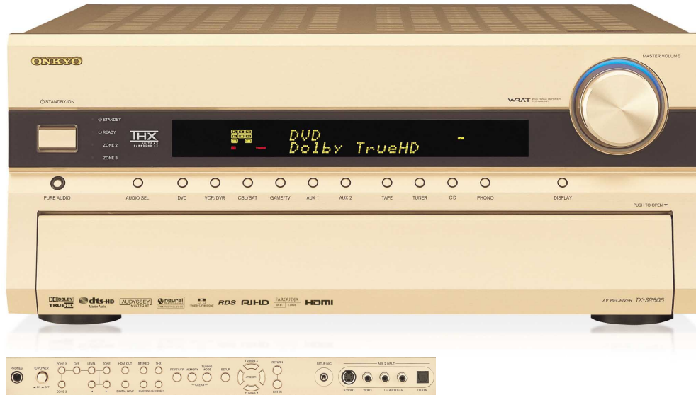
The lesser-used controls are neatly tucked away behind the drop-down panel.