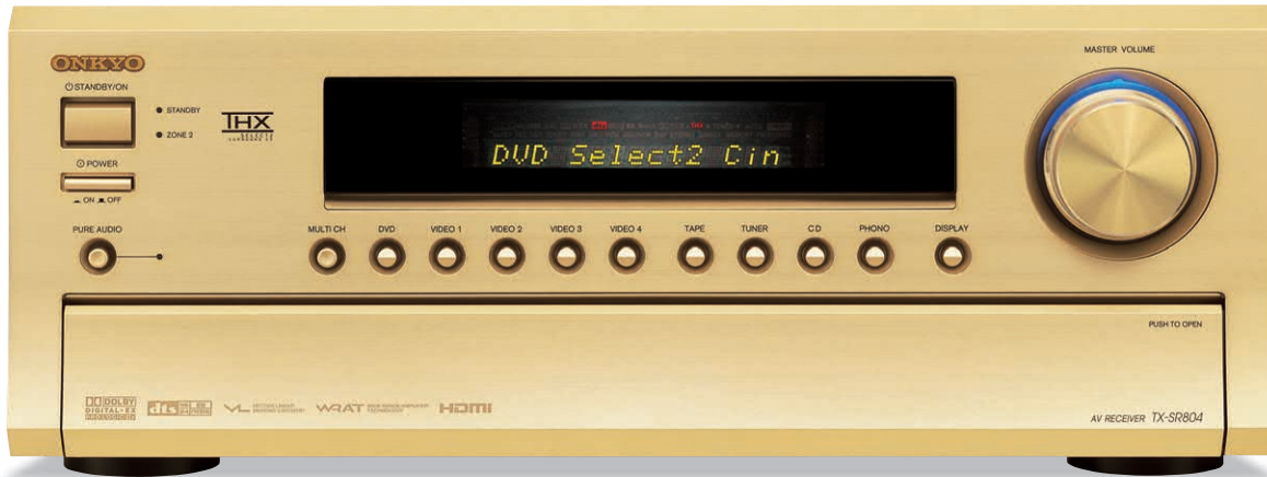
Available in Gold