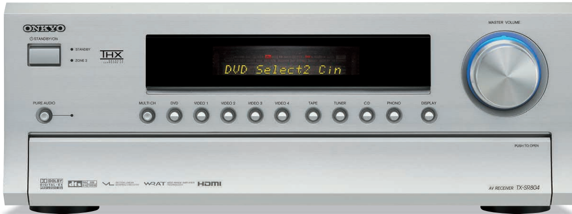
Available in Silver or Black