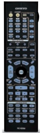
Available in Gold or Black