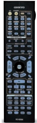
Available in Silver or Black