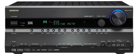
Color availability depends on region.