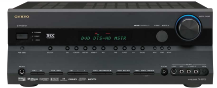
Color availability depends on region.