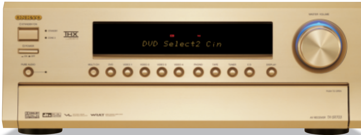
Available in Gold or Black