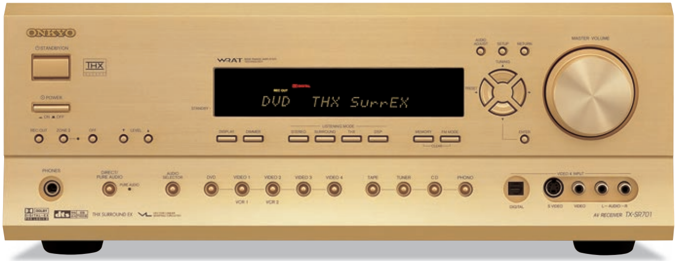
Available in Gold or Black