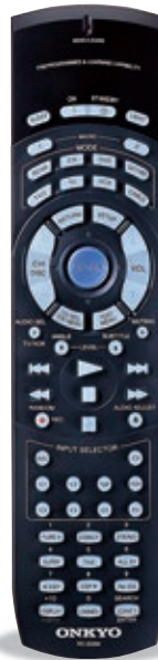
Powerful backlit/preprogrammed learning remote with Macro