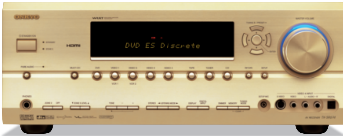
Available in Gold or Black