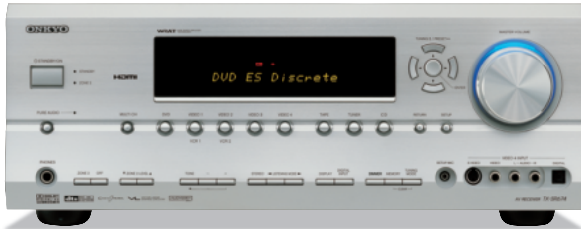
Available in Silver or Black