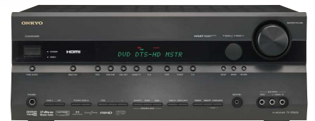
Color availability depends on region.