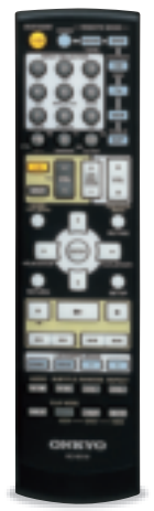
Available in Silver or Black