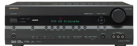
Color availability depends on region.