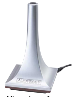
Microphone for Audyssey