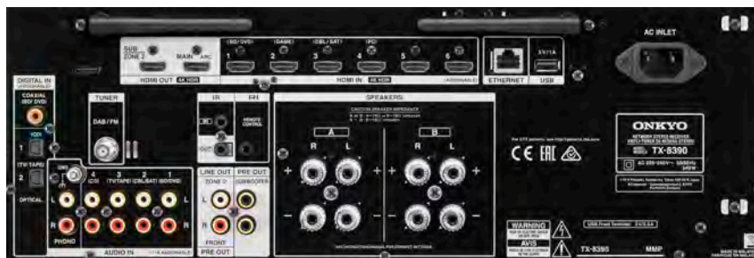
Text on receiver may vary by region.