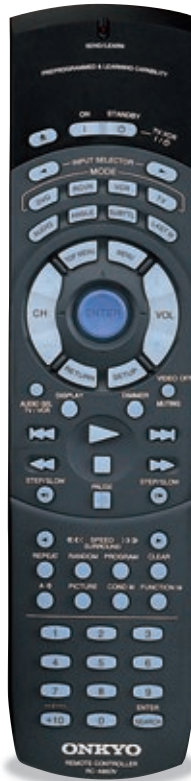
Full-function RI remote