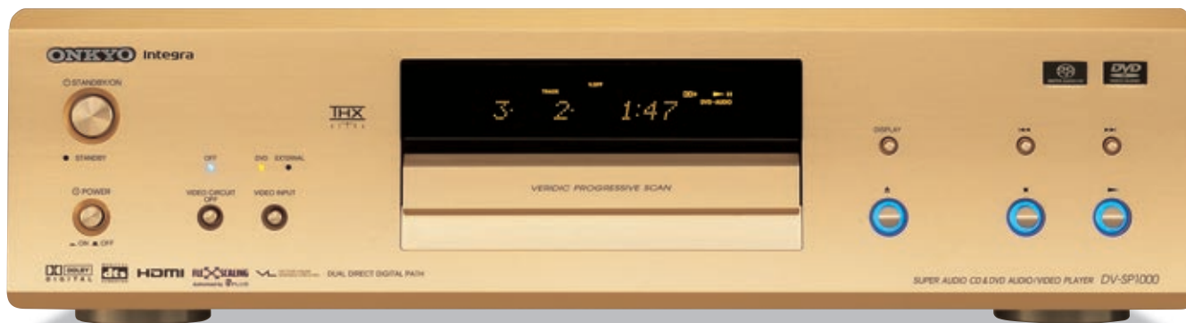
Available in Gold or Black