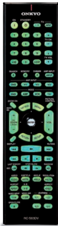
Backlit Remote Control