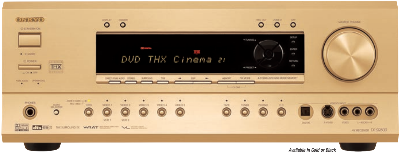
Available in Gold or Black