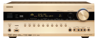
Color availability depends on region.