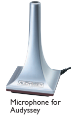
Microphone for Audyssey