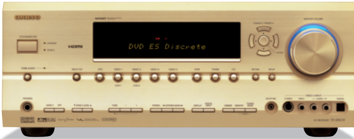
Available in Gold or Black