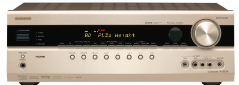
Gold model available only in selected regions.