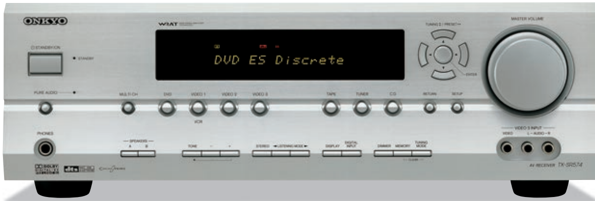
Available in Silver or Black