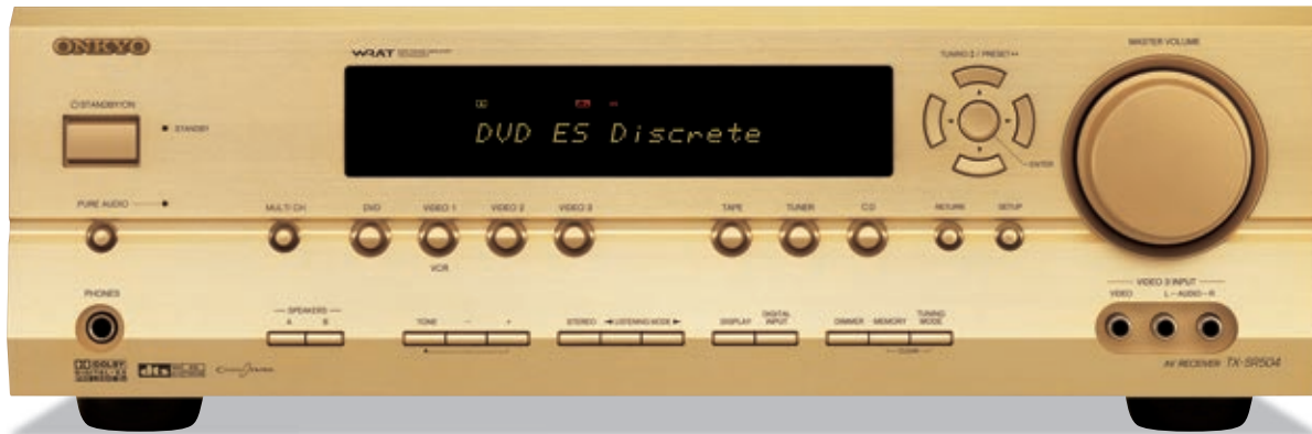
Available in Gold, Black or Silver