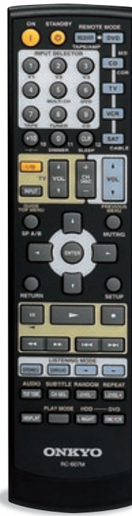
Preprogrammed RI (Remote Interactive) remote