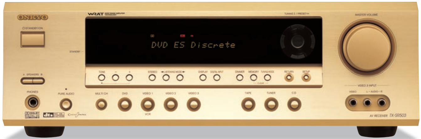
Available in Gold, Black or Silver