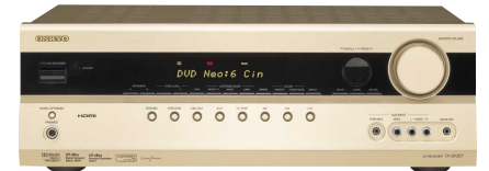
Color availability depends on region.