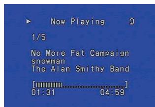
Displaying Track Information